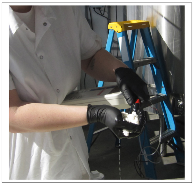
Figure 5. Testing pH using an electric probe, Jasper Hill Farm, Greensboro, Vermont.

The enskillment of artisan producers includes learning to use tools in a way that extends the mind/body into the environment.<sup>21</sup> Such tools include not only cheese knives or harps for cutting curd and various implements to aid in stirring, but also devices to enhance one's understanding of the contingent materiality of milk, curd, and cheese: thermometers, acidity titrators, pH meters, and computerized spreadsheets for data collection (Figures 4 and 5). Arms, hands, and noses are other such tools that must be trained, enskilled. One cheesemaker told me admiringly of an Italian colleague who could feel when the milk was ready for starter cultures to be added, saying, 'His hands are accurate as a thermometer'.