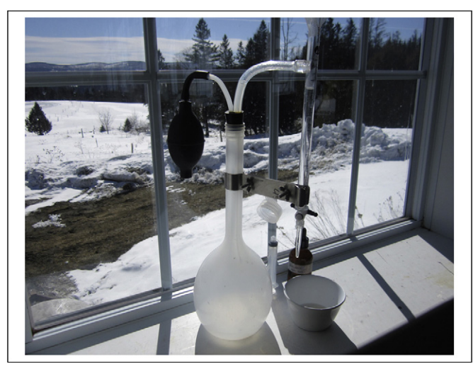
Figure 4. An acidity titrator in the cheeseroom of Jasper Hill Farm, Greensboro, Vermont.

craftspeople can be defined generally as people engaged in a practical activity where they are seen to be in control of their work. They are in control by virtue of possessing personal know-how that allows them to be masters or mistresses of the available technology... It is not craft as 'handcraft' that defines contemporary craftsmanship: it is craft as knowledge that empowers a maker to take charge of technology.<sup>20</sup>